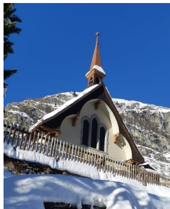
St Peter's Zermatt